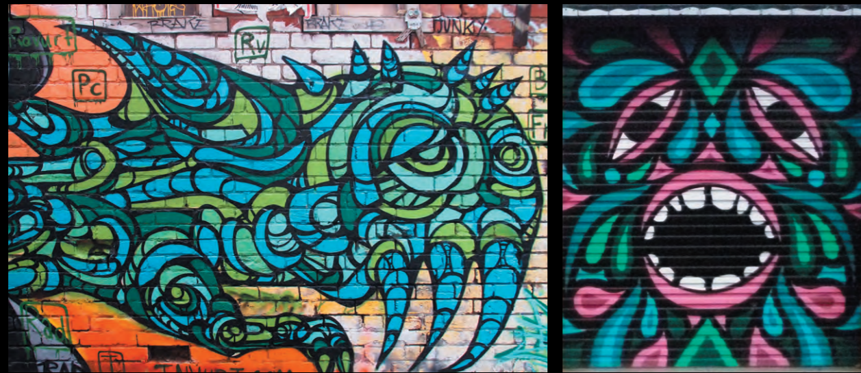
TOP LEFT Beastman, CBD, 2012 TOP RIGHT Beastman, CBD, 2012 BOTTOM LEFT Facter, Prahran, 2012 BOTTOM RIGHT Beastman, Fitzroy, 2011