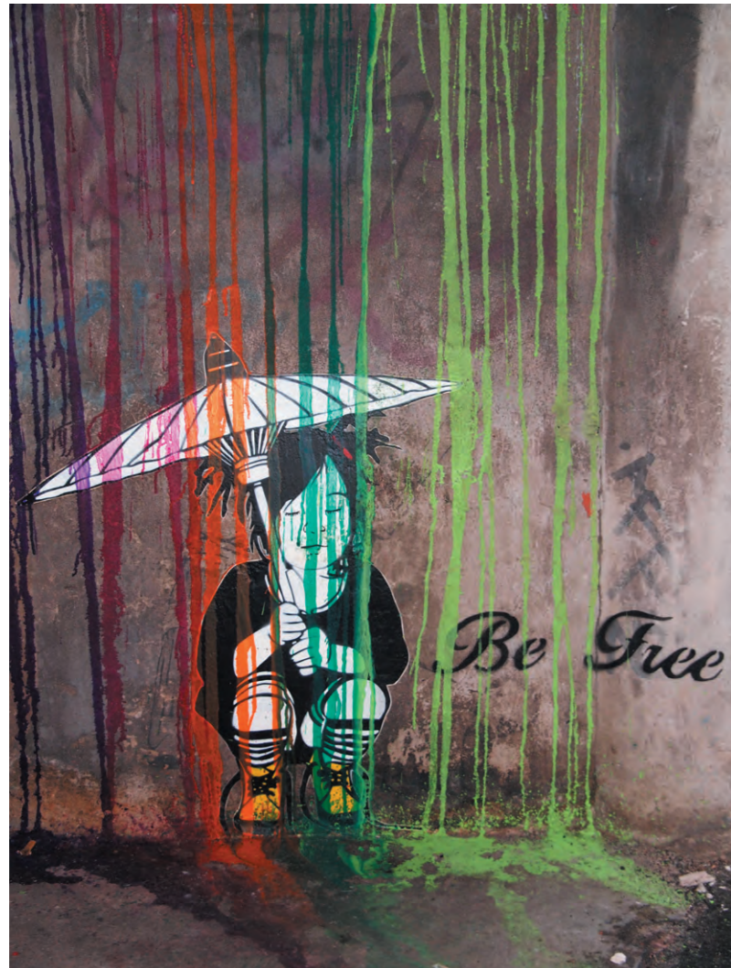
LEFT Be Free, CBD, 2012 TOP RIGHT Be Free, CBD, 2012 BOTTOM RIGHT Be Free, CBD, 2012