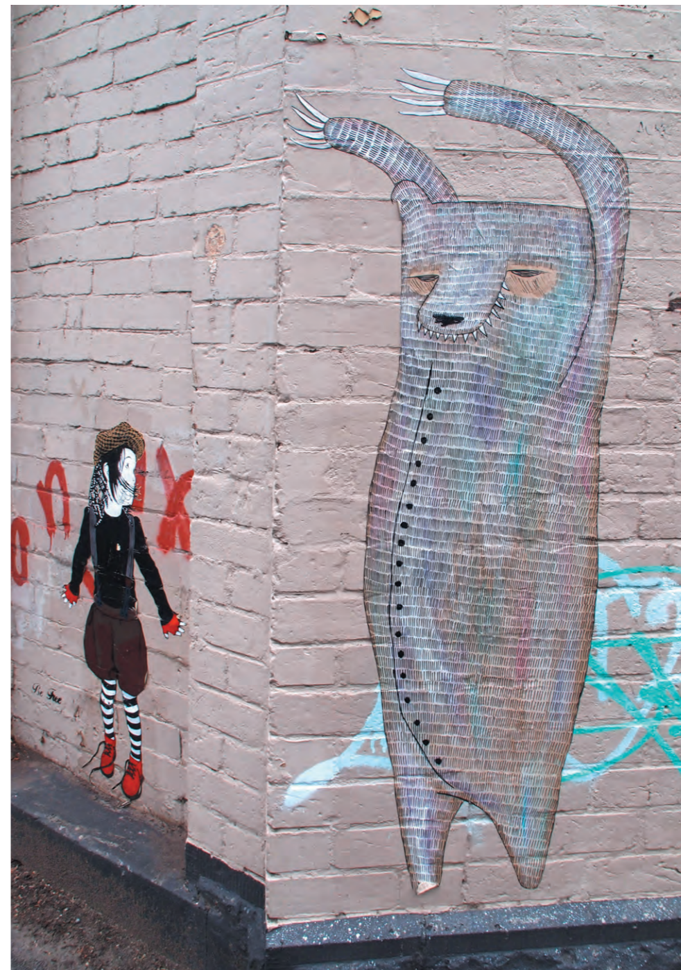
LEFT Be Free and Erin Greer, Collingwood, 2012 RIGHT Be Free, Fitzroy North, 2012